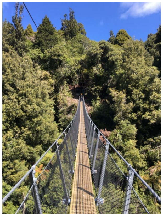
Rotorua Canopy Tours Dansey Reserve Zip Line Forest Adventure

See the next page for more information and please RSVP as soon as possible as limited spaces are available. Also share this with your friends and networks!